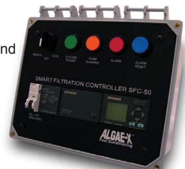
SFC-50 SMART Filtration Controller

The three color-coded lights give an instant visual status report of system power (green), pump running (orange), and alarm (red). The alarm reset is the easily accessible large (blue) push button. The selector switch provides the option of manual operation or running the fully automated program.