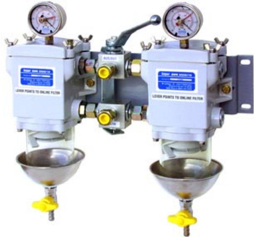
SWK - 2000/10UD

Separ 2000 series water separators fuel filters are a simple solution to many different fuel related problems. Five separate stages of filtration ensure 99.9% water separation at max flow. Low restriction reduces wear on fuel pumps and ensures full RPM's. Back flushable (cleanable) element reduces down time and costly element changes.