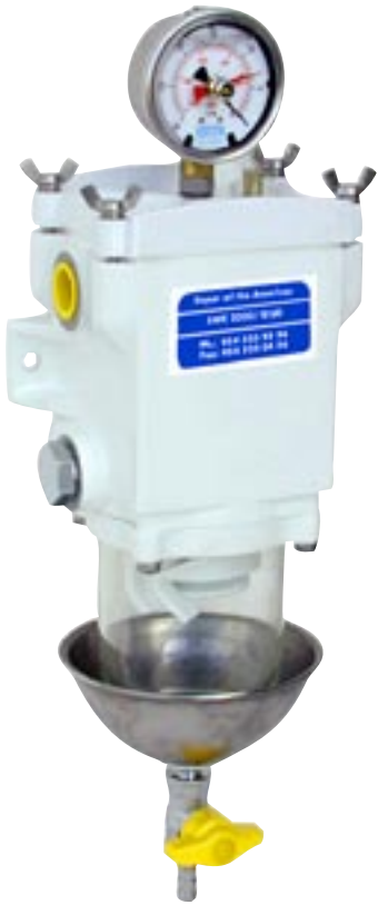
SWK - 2000/10D