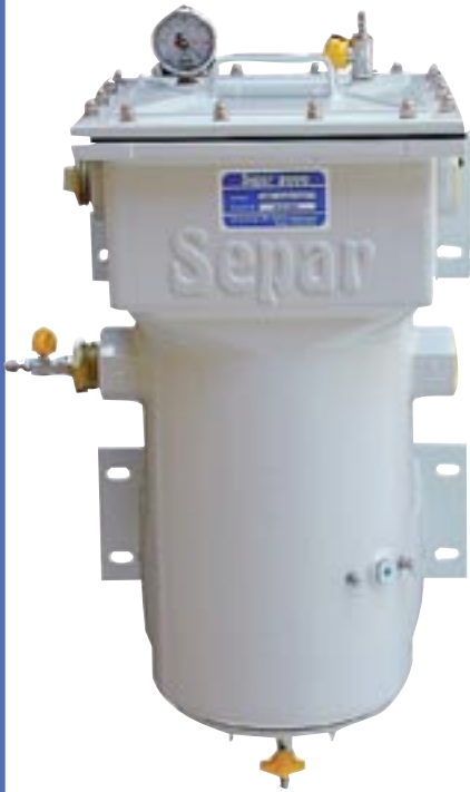
SWK - 2000/130MK