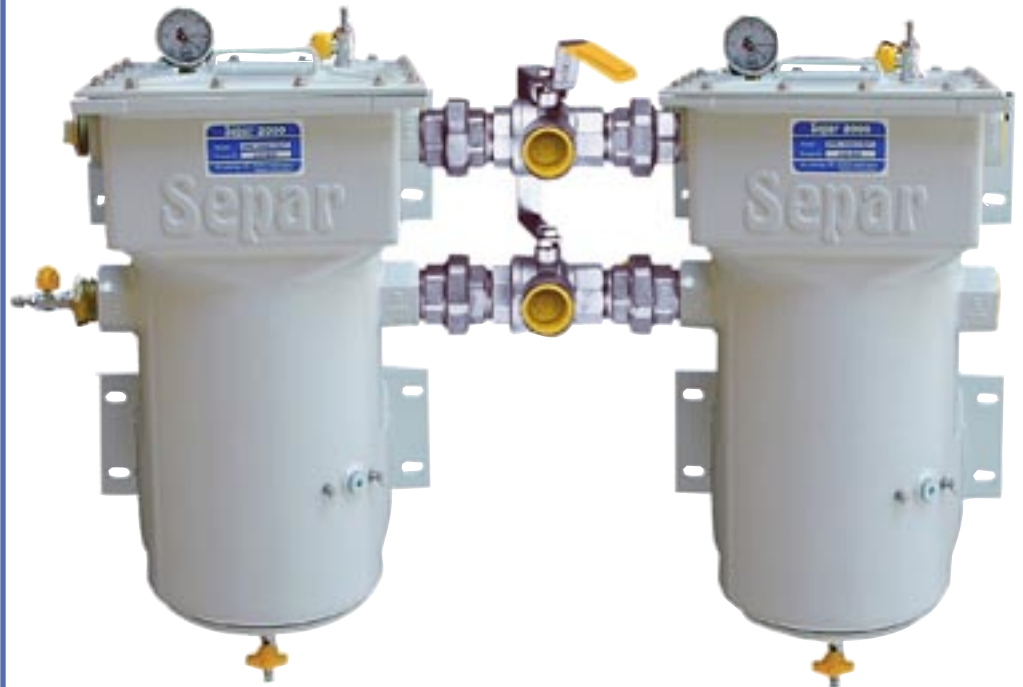
SWK - 2000/130UMK

Separ 2000 series water separators fuel filters are a simple solution to many different fuel related problems. Five separate stages of filtration ensure 99.9% water separation at max flow. Low restriction reduces wear on fuel pumps and ensures full RPM's. Back flushable (cleanable) element reduces down time and costly element changes.